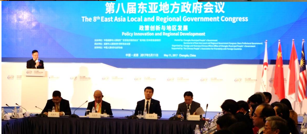
The 8th East Asia Local and Regional Government Congress (2017 Chengdu City, Sichuan Province, China )