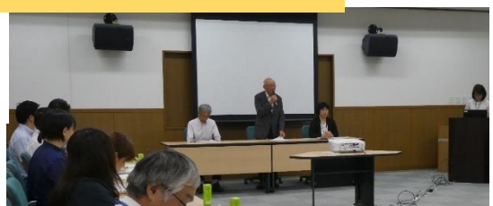
Welfare and Medical Treatment Sub Session (2019 Koryo Town, Nara, Japan)