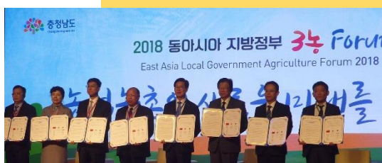
East Asia Local and Regional Government Forum on Agriculture, Rural Communities and Farmers (2018 Chungcheongnam-do Province, Korea)